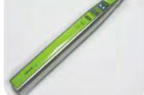
Friendo Pen (F-1001)