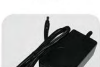
AC Adapter (AC-1002)