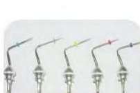
Friendo Pen Tip: 5 sizes (FE-1004-XF, F, FM, M, ML)