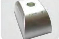
Charging Station (F-1002)