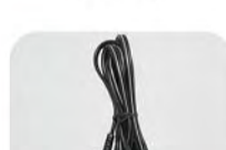
AC Power Cord (AC-1001)