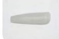
Safety Protector (FE-1003)