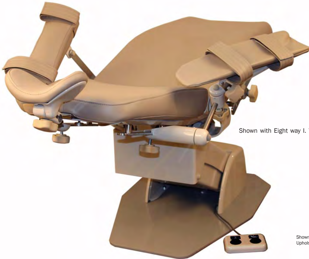
Shown with Eight way I. V. arm option