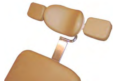
Chinner headrest option