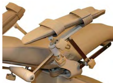
Eight way articulating I. V. arm option Interchangeable Left and Right