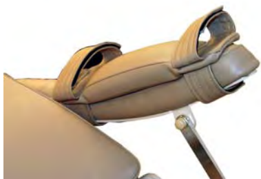
Standard I. V. arm pillow Interchangeable Left and Right