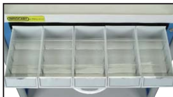
3" Drawer with Removable Trays and Dividers