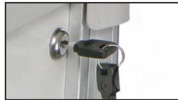
1 Key Lock Secures All Drawers