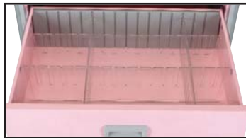
6" Adjustable Drawer Dividers Set (1 Set Included)