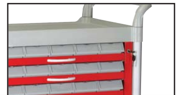
Key-Locks Control Drawers on Each Side