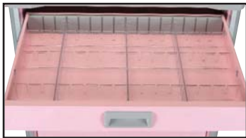
3" Adjustable Drawer Dividers Set (1 Set Included)