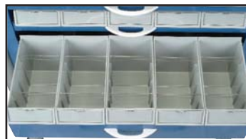
6" Drawer with Removable Trays and Dividers