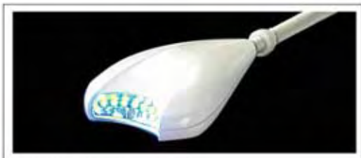
LED Whitening Arch