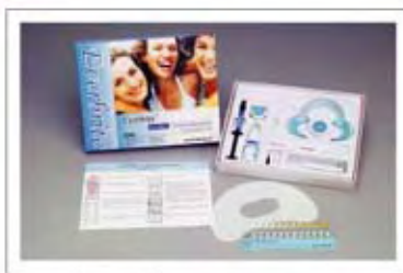
Everbrite™ In-Office Tooth Whitening Kit