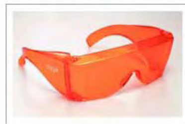
Eye Protection Glasses