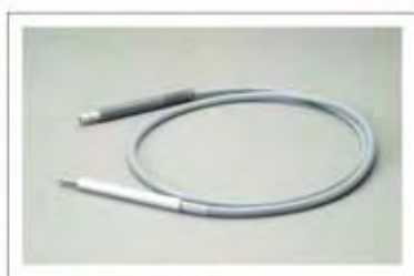
Handpiece Cable Fingertip Activator Ring

■ LITEX 686 LED — Camphorquinone ■ Halogen Lamps