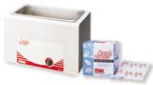
Clean&Simple™ Ultrasonic Cleaners and Tablets

Documents: date, time, temperature, pressure.