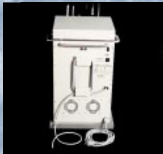
Auxillary Air & Water Quick Connects; Automatic Waste Removal; Additional Electrical Outlet