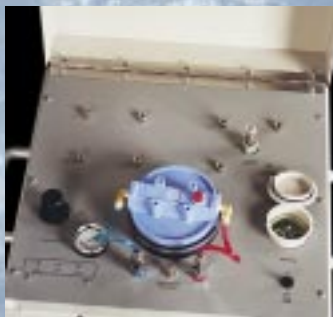
Easy Access to Control Panel