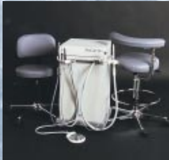
Sleek Design for In-office Use

1.5 liter reservoir Pressurized system: 30 to 40 lbs Aseptic non-retracting HPC coolant Handpiece flush system External quick connects for water and air