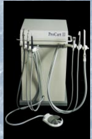
Swing-Out Instrument Arms